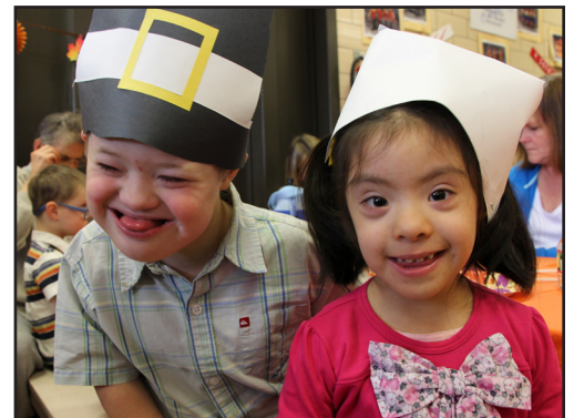
Students from the Stepping Stones School partake in a Thanksgiving celebration. They enjoyed dressing up as pilgrims and indians to commemorate the holiday.

including Halloween, Thanksgiving, and Holiday celebrations. They also welcomed the Paper Mill Playhouse in mid-December where the performers and students expressed creativity and enjoyed performing.