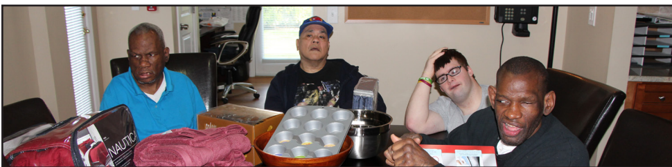
Beacon Group Home residents are welcomed to the neighborhood with gifts donated by the community.

In August 2014, four men moved into The Arc of Essex County's newest group home on Beacon Avenue in Livingston, New Jersey. In order to transform this three-bedroom ranch into a home, a gift registry was established at Bed Bath & Beyond in the hopes that advocates of The Arc would purchase items to furnish the house and welcome the gentlemen to the neighborhood.