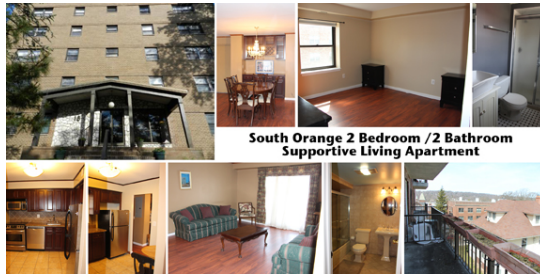
South Orange 2 Bedroom / 2 Bathroom Supportive Living Apartment