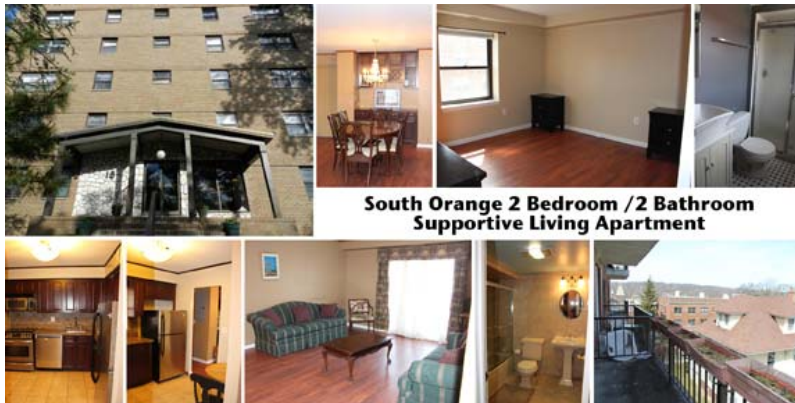
South Orange 2 Bedroom / 2 Bathroom Supportive Living Apartment