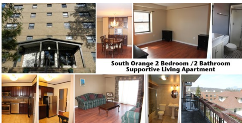
South Orange 2 Bedroom / 2 Bathroom Supportive Living Apartment