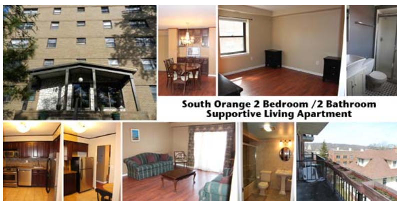
South Orange 2 Bedroom / 2 Bathroom Supportive Living Apartment