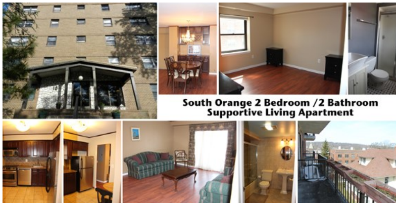
South Orange 2 Bedroom / 2 Bathroom Supportive Living Apartment