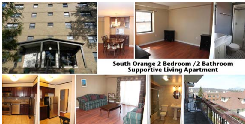
South Orange 2 Bedroom / 2 Bathroom Supportive Living Apartment