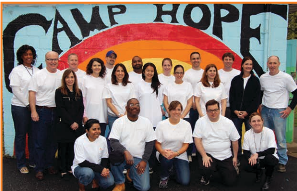
A group of employees from the Novartis Pharmaceuticals Corporation's East Hanover location volunteered their time to paint and clean at Camp Hope on May 8, as part of their company's Community Partnership Day.

A team of volunteers from Novartis Pharmaceuticals Corporation spent the day painting and cleaning at Camp Hope as part of the company's Community Partnership Day activities.