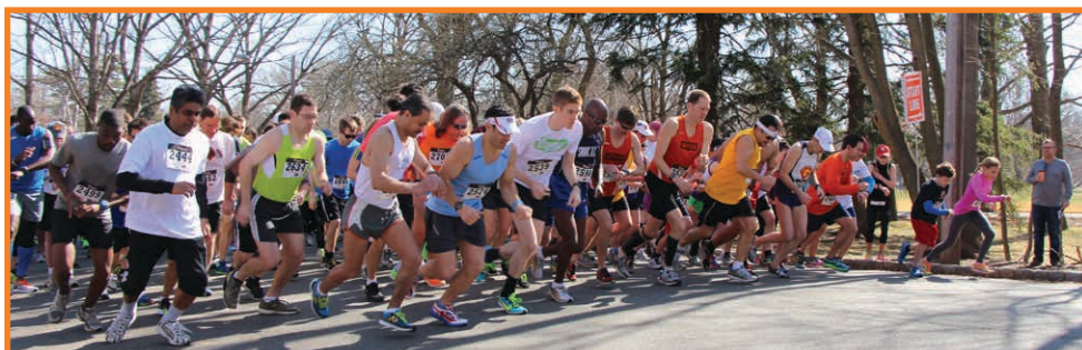
Runners take off from the start of the 16th Annual Building Tomorrows 5K Run in Brookdale Park on April 12, 2014.