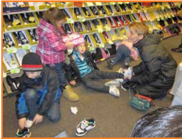
Children pick out and show off their new shoes at Payless Shoes in East Orange NJ. The Arc of Essex County received $1,000 grant from Payless to cover the cost of new shoes for children in our Home Assistance Program.

For the second year in a row, The Arc of Essex County received a Payless Shoes 4 Kids grant which provided the agency with 50 gift certificates for children's shoes, a $1,000 value. Our HAP staff brought a group of families to the store so their children could get measured and pick out new shoes. The children had bright smiles on their faces as they