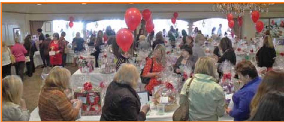
Some of the over 500 people who came out to this year's Warm Your Heart Tricky Tray examine items carefully as they decide which ones they would like to try to win.

The 18th Annual Warm Your Heart Tricky Tray was a huge success, with 530 people attending and raising over $40,000 for The Candle Lighters.