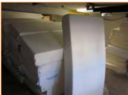
New mattresses, donated by the United Way of Essex and West Hudson, await distribution to consumers in our Adult Residential programs.